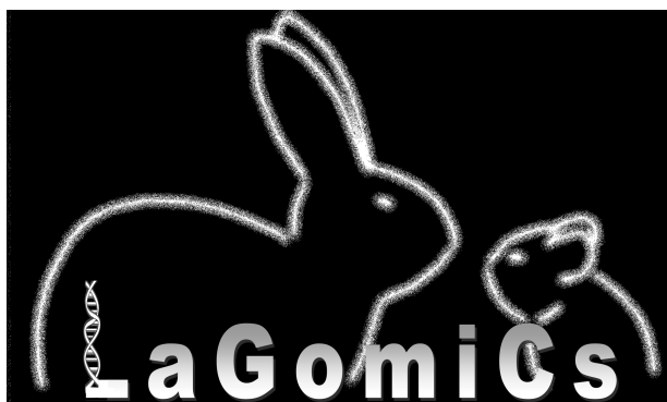
Figure 2. Official logo of the Lagomorph Genomics (LaGomiCs) Consortium.

The ‘Sample Accession’ is a stable identifier, which will be assigned to a sample when it is registered to the database. This accession will